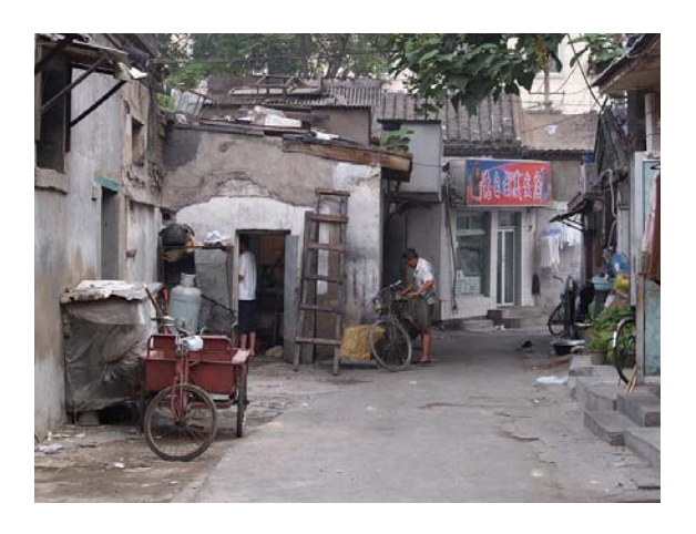
Figure 2. A hutong before cars arrived

The Chinese word hutong refers to narrow alleys found in historic neighborhoods in Beijing. They are similar to the streets in low-income parts of many older cities around the world. Figure 2 shows a hutong before cars arrived.