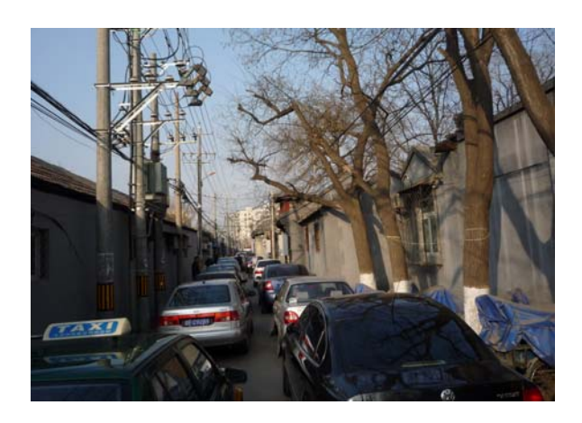
Figure 3. Unregulated parking and resulting traffic in a hutong

Many drivers avoid using their cars because parking will be difficult when they return. Some have devised ingenious tricks to preserve their parking spaces when they do leave, such as erecting temporary sheds to prevent anyone else from parking (Yang 2016). In effect, car owners privatize public land by encroaching on the streets.