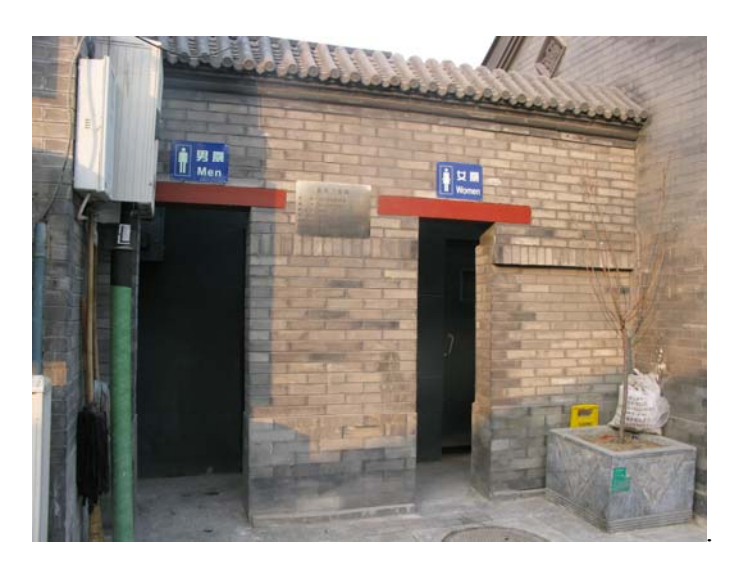
Figure 6. Public Toilet in Xisi North 6<sup>th</sup> Alley

The pilot program also improves public services. Government employees clean the public toilets (Figure 6). Surveillance cameras and 24-hour patrol officers increase security. Private firms provide other services including street cleaning, trash collection, and landscape maintenance.