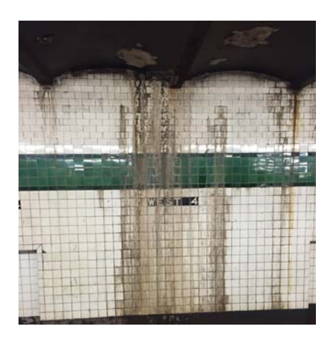
Figure 11. Subway station at West 4<sup>th</sup> Street in Manhattan

Because the lowest price for off-street parking in Chinatown is $40 a day (<u>Parkopedia</u>), charging market prices for on-street parking can produce substantial revenue to repair broken sidewalks, plant street trees, install security cameras, or remove the grime from subway stations (Figure 11). Many people will benefit from these public services while few will pay for on-street parking (Shoup 2011, 442-450).