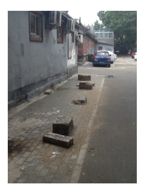
Figure 8. Temporary barrier to protect an illegal parking space

regularized parking will be much more efficient than putting physical barriers in illegal parking spaces while drivers are away (Figure 8). The income from the formal market for short-term parking should increase the value of a permit to its holder, and this revenue potential will increase both the permit's auction value and the resulting revenue to pay for local public services.