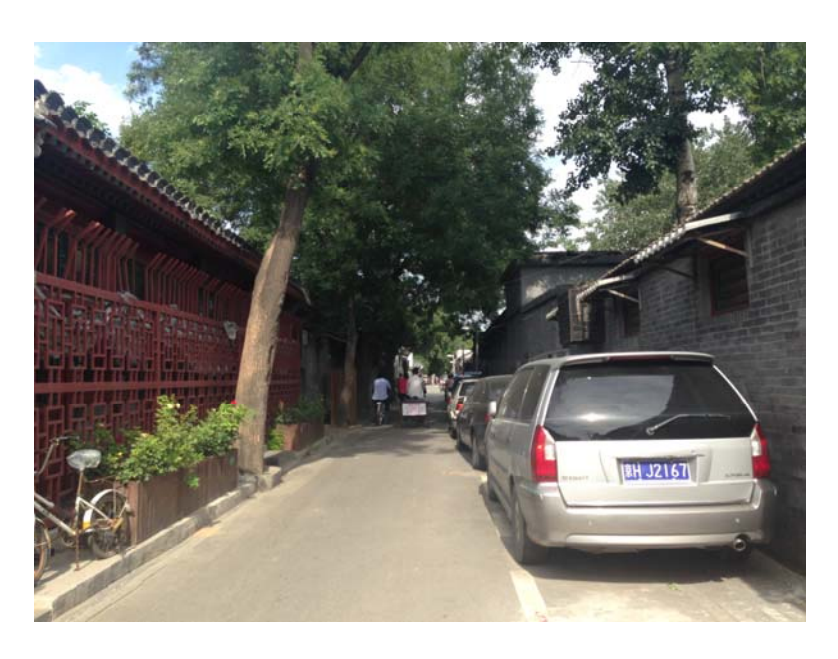
Figure 5. Regularized parking spaces in Xisi North 7<sup>th</sup> Alley

The pilot program also improves public services. Government employees clean the public toilets (Figure 6). Surveillance cameras and 24-hour patrol officers increase security. Private firms provide other services including street cleaning, trash collection, and landscape maintenance.