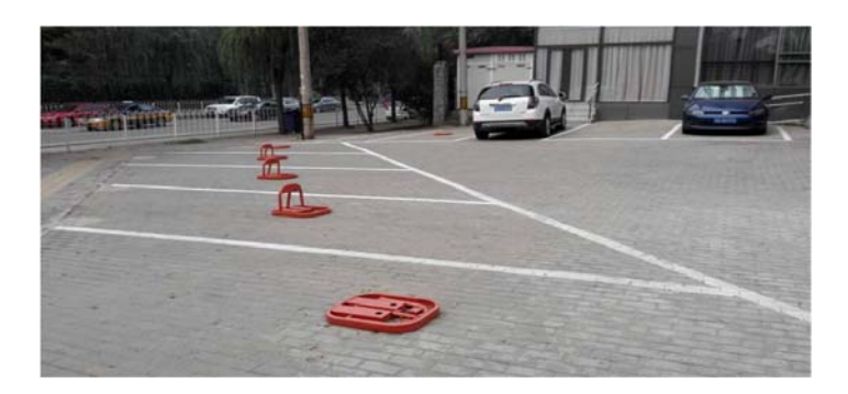
Figure 7. Barriers to secure reserved parking spaces

The permits can be for either assigned (reserved) or unassigned (random) spaces in the alley. If the spaces are assigned, permit holders can be given the right to erect a temporary barrier when they leave to ensure that their spaces will be available when they return. These temporary barriers are often used to prevent unauthorized use of the assigned spaces at apartment buildings in China (Figure 7). If the spaces are unassigned, the city can give discounts for shorter cars, so that more cars can park in the alley (Shoup 2014c).